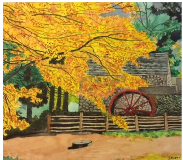
The Mill in Autumn, 9 x 12, watercolor