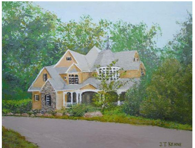
Home in Connecticut, acrylic