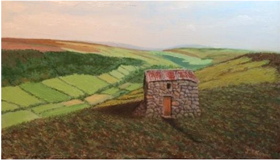
Old Shooting Lodge, Yorkshire, 12 x 20, oil