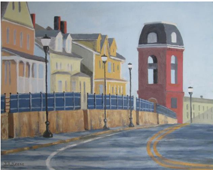
Saxonville Old Mill Bell Tower, 16 x 20, oil on canvas