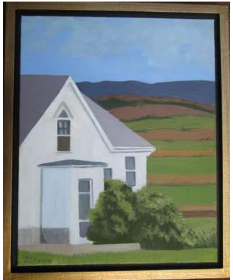
Nova Scotia Farm, 20 x 16, oil on canvas