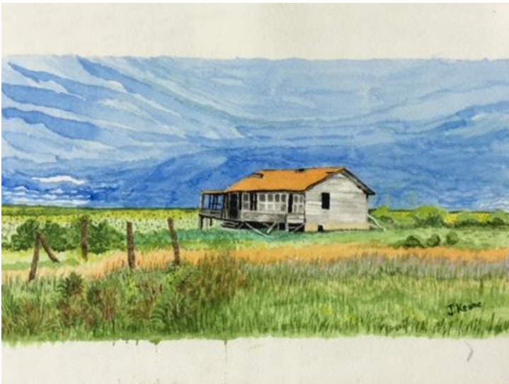
Forgotten Homestead, 9 x 12, watercolor