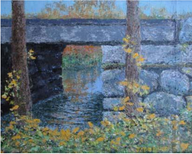
1635 Bridge at Wayside Inn, 14 x 18, acrylic