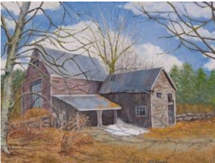
Last Patch of Winter Snow, 18 x 24, oil on canvas