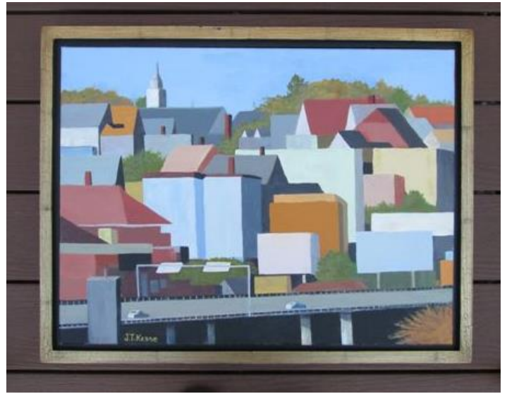
From a Cambridge Window, 18 x 24, acrylic on canvas (Somerville, MA)