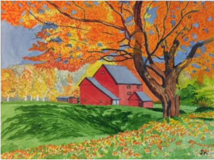
Shady Autumn Coolness, 9 x 12, watercolor