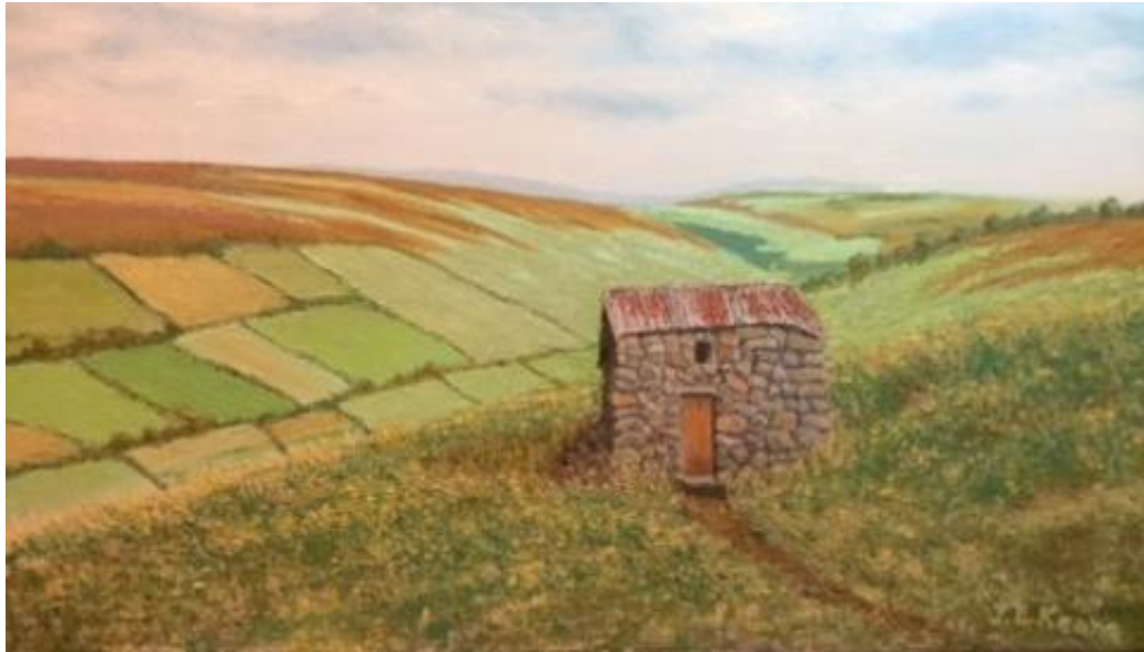
Old Shooting Lodge, Yorkshire, 12 x 20, oil