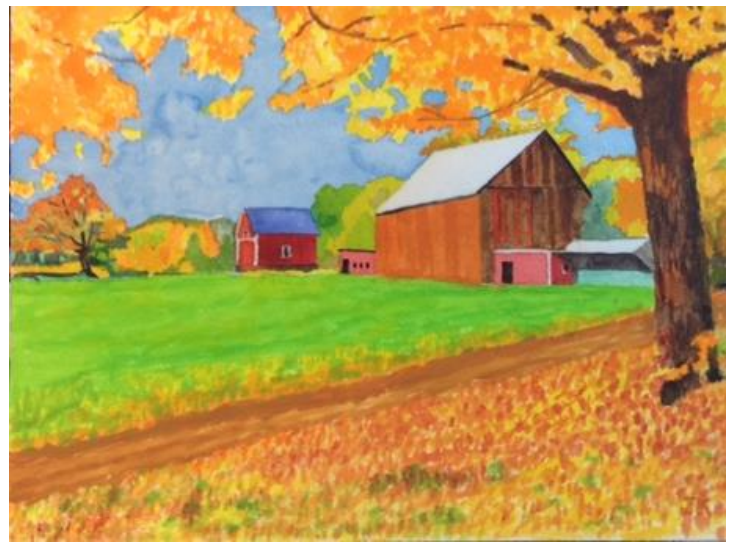
Autumn Farm, 9 x 12, watercolor