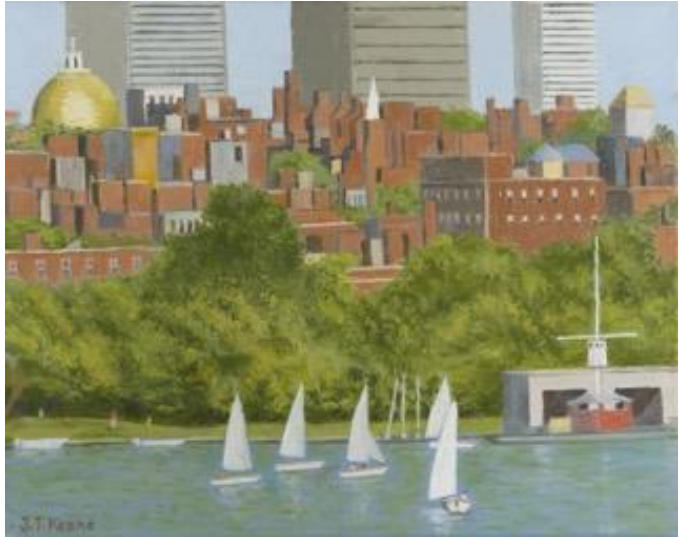
Beacon Hill on the Charles, 16 x 20, oil on canvas