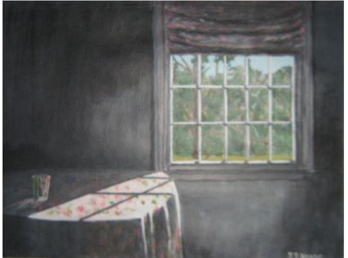
Waiting, 12 x 16, watercolor