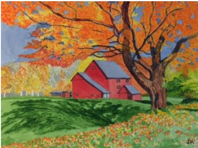
September Shade, 9 x 12, watercolor