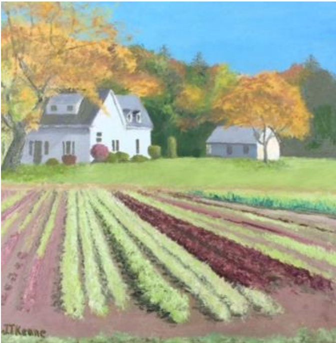
Home and Garden, 12 x 12, oil on canvas (Concord, MA)