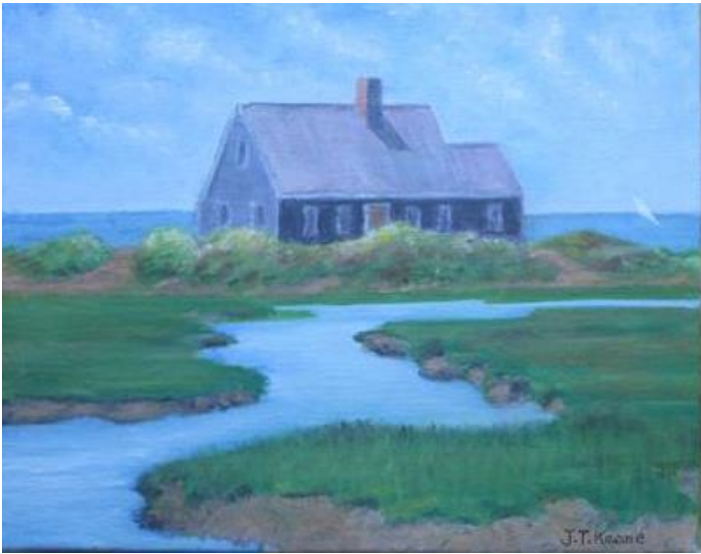
Quiet at the Cape, 8 x 10, oil on canvas