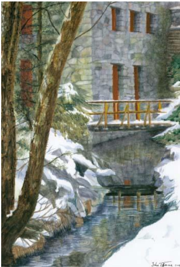
Grist Mill Bridge, 24 x 18, watercolor