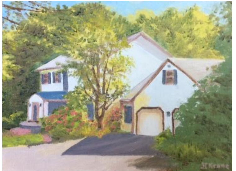
Next Door Neighbor's House, 9 x 12, oil on board