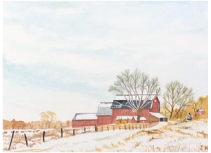
Winter Morning, 9 x12, watercolor