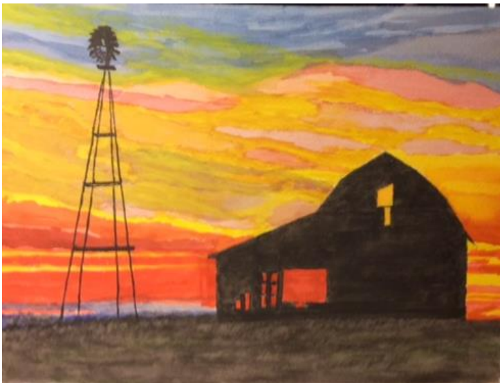
Kansas Sunset, 9 x 12, watercolor