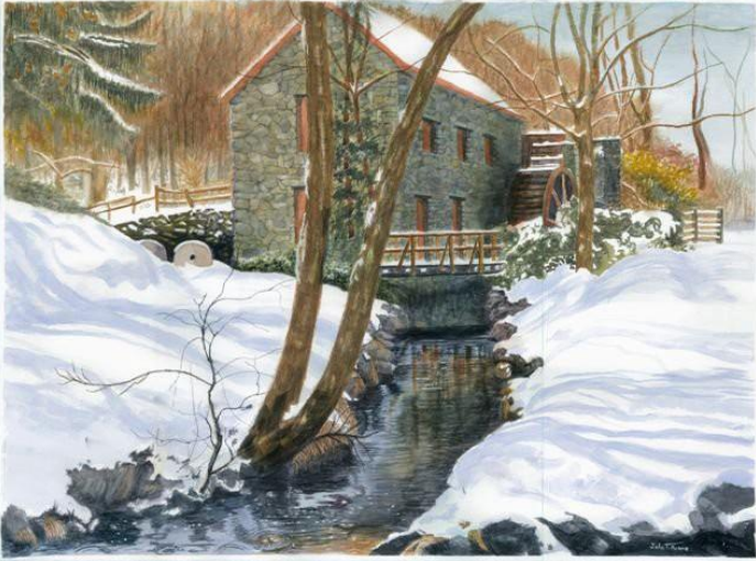
Gristmill in Winter, 22 x 30, watercolor (Sudbury, MA at Longfellow's Wayside Inn)