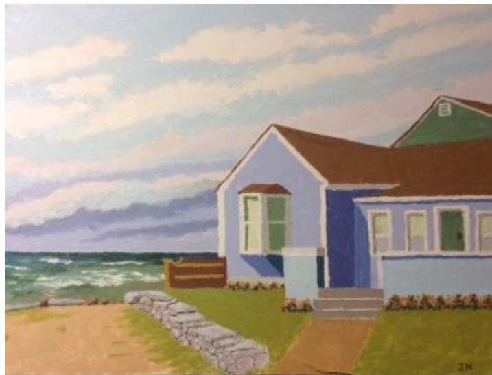
Oceanside Home, 9 x 12, watercolor